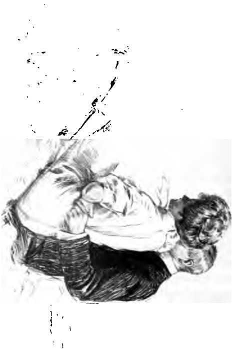
He dropped beside her and took her hand Page 427